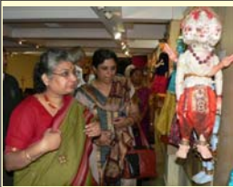
Puppet show Page -6

This hefty award is instituted by Karnataka's own proud cine artiste Dr. B. Saroja Devi, who is the recipient of the country's coveted civilian honour, the Padma Bhushan.