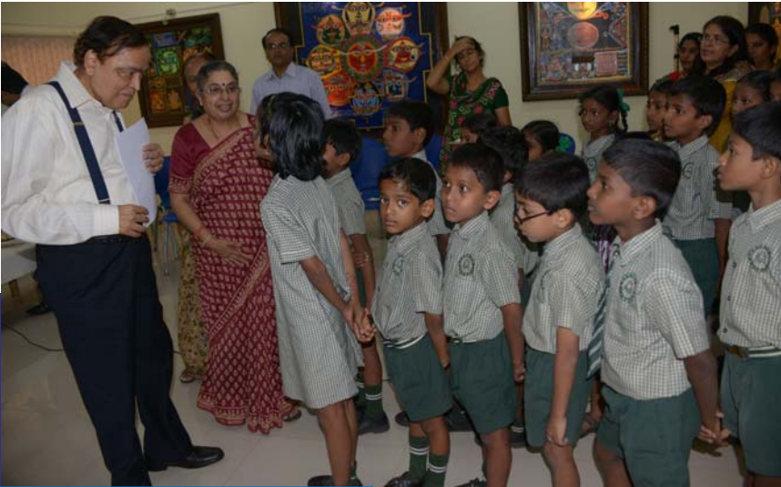
Sri. Murali S. Deora, Member of Rajya Sabha and Vice - President, Bharatiya Vidya Bhavan, Mumbai, visit Bhavan-BBMP Public school at Srirampuram on September 16, 2013.