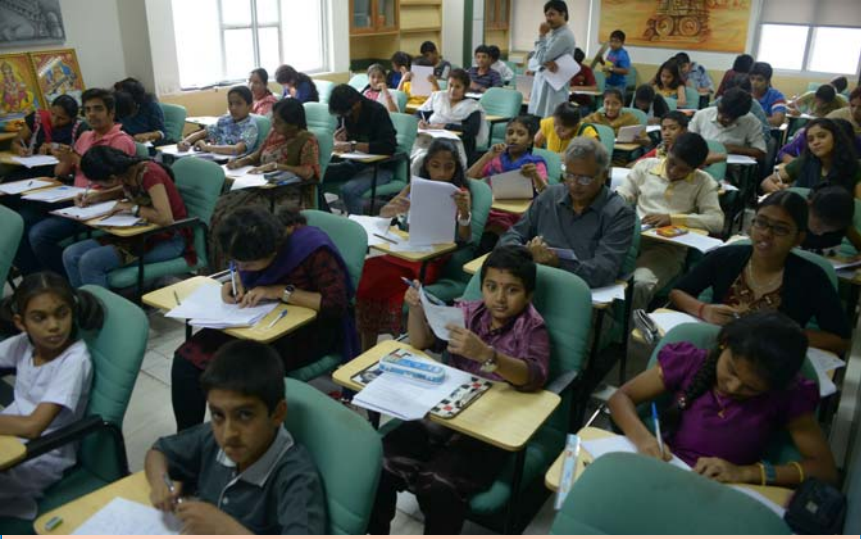
A view of young and old all are students of Bhavan's Kalabharathi writing the annual theory exams - 2013.