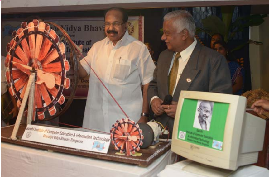
Dr. M. Veerappa Moily, Union Minister for Petroleum and Natural Gas, rotates the symbolic Charaka to mark the inauguration of the Gandhi Institute of Computer Education- As Charaka rotates computer starts functioning

Union Minister, who is unarguably the father of this prestigious programme of the Bhavan, which was launched in 1996.