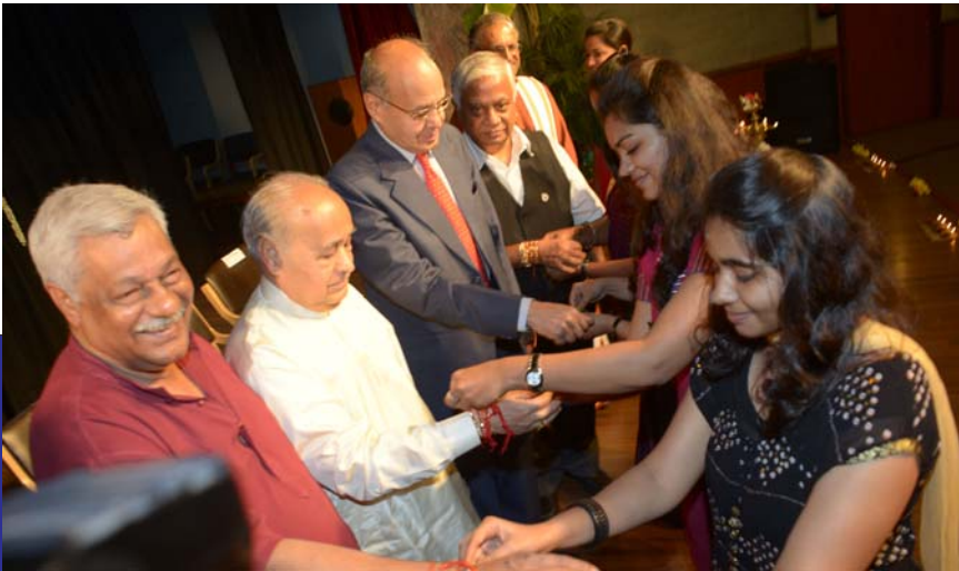
M.B.Birla Institute of Management students tying Rakhi to dignitaries

Tying Raksha Bandhan by women to men in the gathering was the highlight of programme.