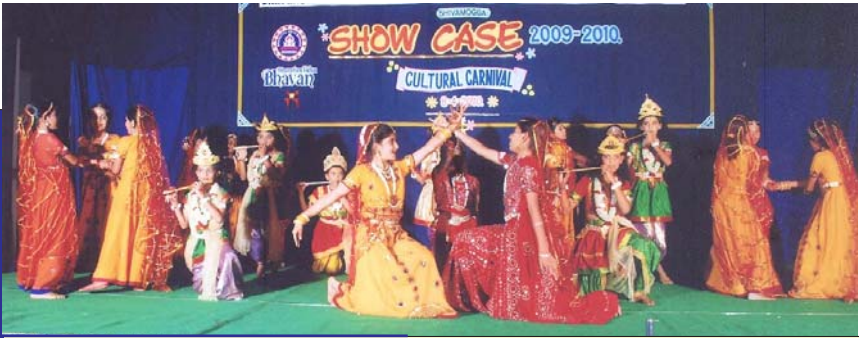
Children performing during the programme

The entire programme was so well organized, thanks to the Principal and his staff, that it will be remembered for long. ●