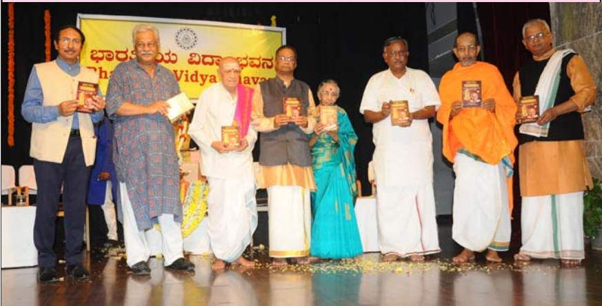
A CD on ‘Veda Mantras’ created by the monetary support by Shantha Sridhara Charitable Trust was launched