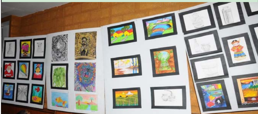
Display of art work by the students under the direction of Smt. Insha Ummehani