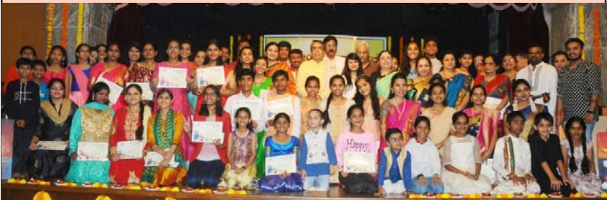
Kalabharati diploma holders along with dignitaries

It is good for the growth and health of the mind. Now that the students had completed their courses, they could pursue them as hobbies or as teachers and pass on their legacies. They now possessed the ability to analyse